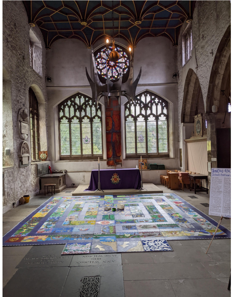
KENDAL PARISH CHURCH